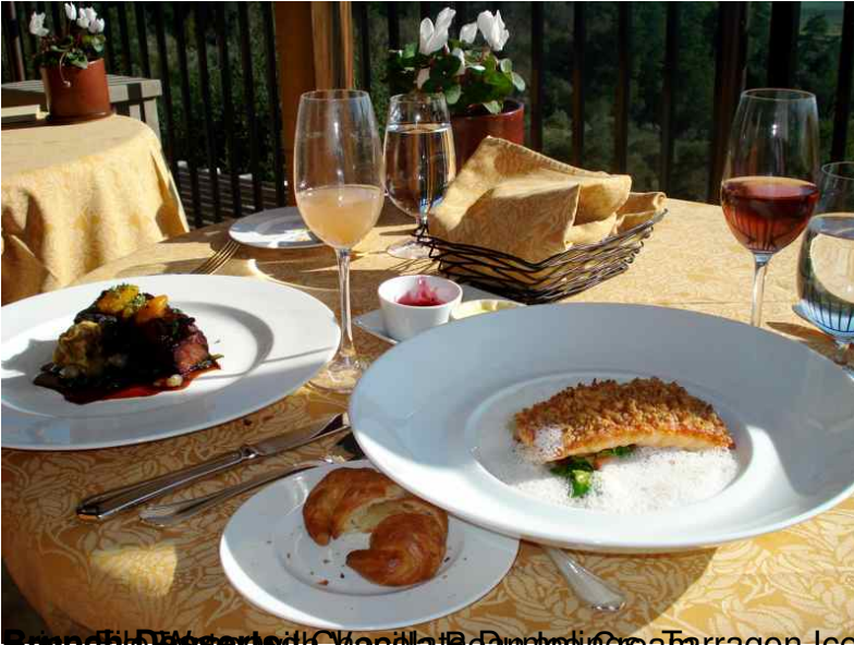
Arbequina Olive Oil Fairy

Wednesday, 09 March 2011 11:16 - Last Updated Friday, 22 April 2011 09:11